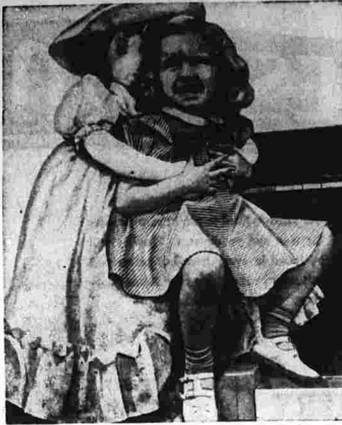
When a big rag doll holds a sweet little girl, that's news. Here it is. The doll stands as high as the 3-year-old who was fascinated to the extent she forgot all about the camera and the elaborate toy piano which had previously caught her eye in a New York toyland.